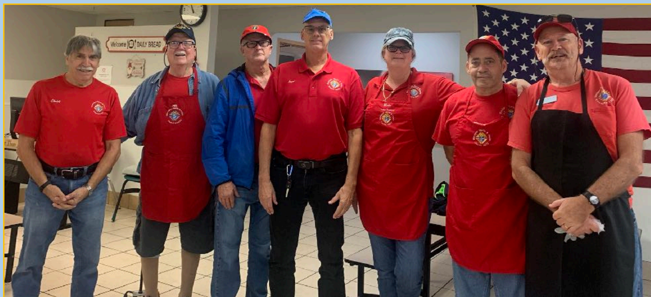
Daily Bread — December 22